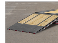
DEMCO EZ LATCH GOOSENECK COUPLER

Simplify loading and unloading with our cutting-edge Hydraulic Dovetail feature. This push-button design allows for effortless raising and lowering of the dovetail, accommodating a variety of equipment sizes and ensuring a seamless and secure hauling experience.